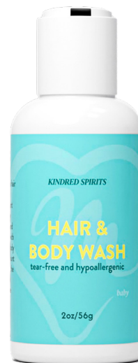
Hair & Body Wash