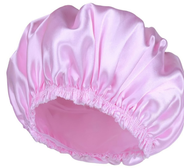
Satin Lined Shower Cap