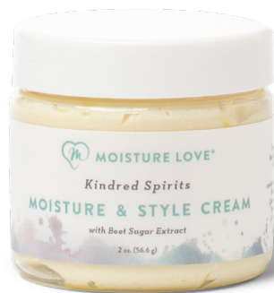
Moisture & Style Cream