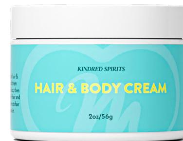
Hair & Body Cream