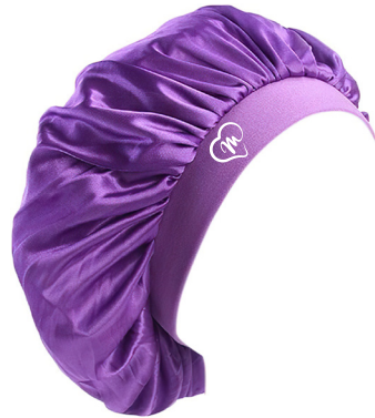
Satin Lined Bonnet