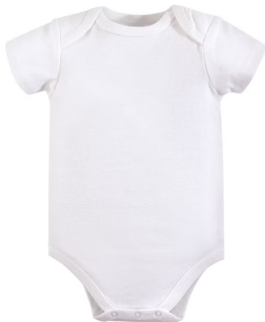
Baby Cotton Bodysuit