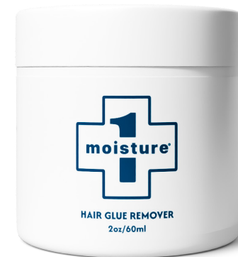
Hair Glue Remover