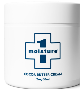
Cocoa Butter Cream