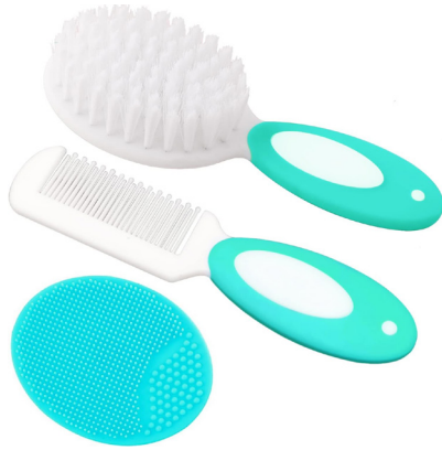
Baby Hair Brush